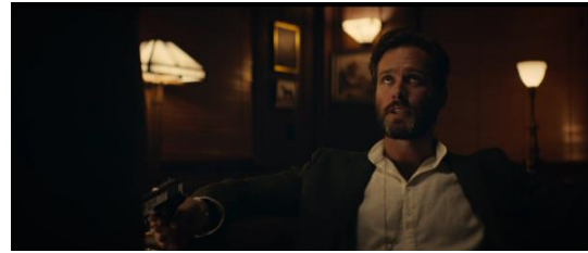
Figure 4. the owner of Worryfree with a gun pointing out to Cassius

the function is to legitimate power of the capitalist.