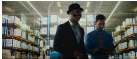
Figure 2. the owner of Regalview offering the salary

at humans, in this case, workers, based on how much money they will produce for themselves (exchange value) called commodification. According to Tyson (2014), commodification is the act of relating object or person in terms of their exchange value.