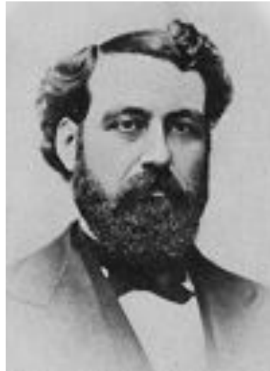
Figure 4.1. Philip Paul Bliss 1838-1869.