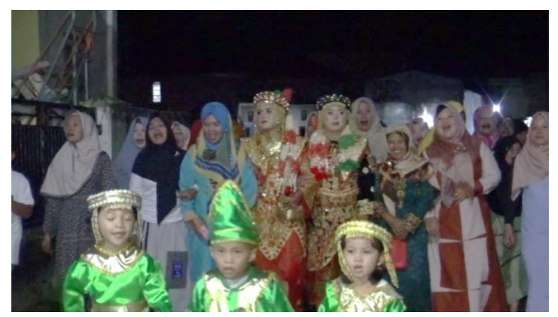
Future 1. Process as a Balahak performance