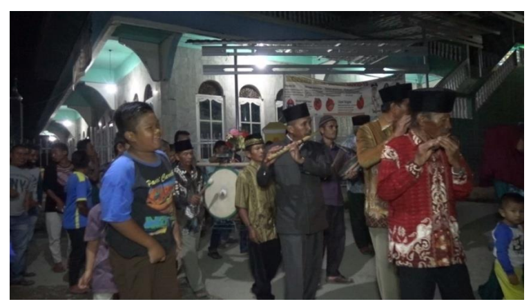
Future 2. a music in Balahak performance

It can be concluded through the Balahak circuit process also according to what is statedKinesti (2015)Performance is a system of relationships between parts in one whole.Soedarsono (2010:5)also stated the Show is a blend of various important aspects such as plays, performers, fashion, accompaniment, performance venues and audiences. In the