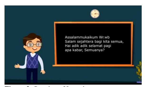
Figure 2. Opening of Learning

It can be seen in Figure 1 that the initial page already has the name of the author and the agency of the author. In the next video display, namely the opening of the previous lesson, the display is in Figure 2.