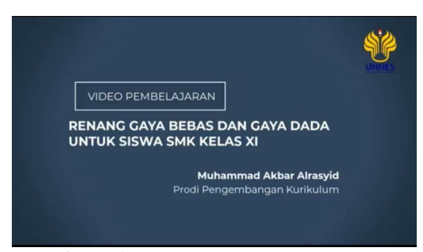
Figure 1. Start Page of Learning Video

For example, the start page of this learning video is presented in Figure 1.