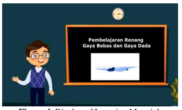
Figure 4. Display of Learning Materials

In Figure 3 it can be seen that the display of learning objectives in the swimming video for SMK has 5 objectives. As for Figure 4, it is learning materials.