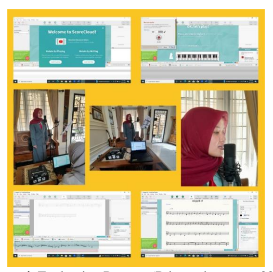
Figure 4. Evaluation Process (Private document, 2023)

through the Score Cloud application which can translate the sound from the imitation of singers back into Notational Transcripts.