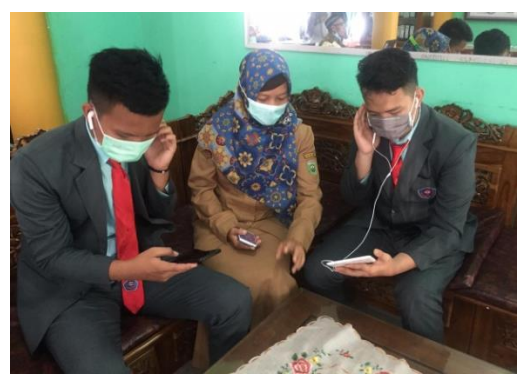
Figure 3. The process of students imitating the sound from the Score Creator translation

7. The seventh step is the final/evaluation step, where the results of imitation of students/singers are detected/evaluated