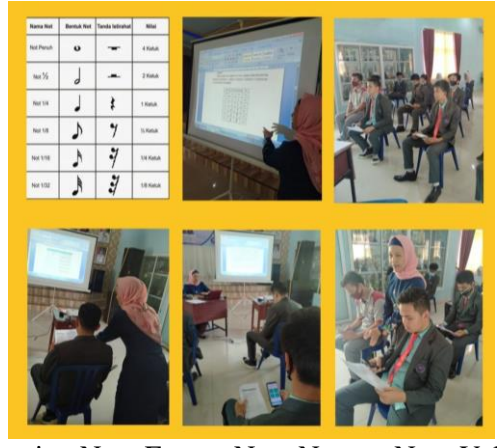
Figure 2. Photo 2-7. Learning Note Forms, Note Names, Note Values, Note Functions and Locations, Notation Transfer Process to the Score Creator Application and The teacher's process guides students in copying notes (Private document, 2023).