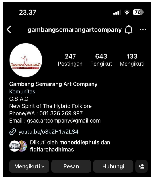
Figure 3. Gombang Semarang Art Community Instagram

Social media is used to market Gambang Semarang to the wider community. Interesting content about Gambang Semarang, such as photos, videos and stories, is shared on various social media platforms, such as Facebook, Instagram and Twitter. In these ways, Gambang Semarang is increasingly being introduced to the wider community and can help in preserving the sustainability of this culture.