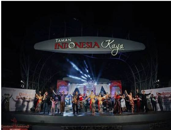
Figure 4. Gambang Semarang Performance