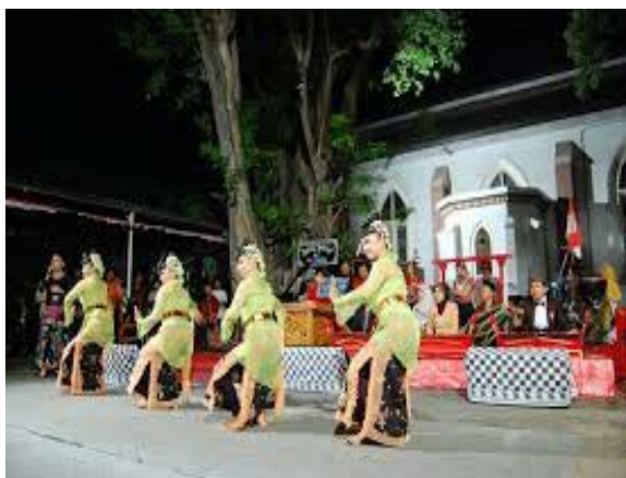
Figure 1. Gambang Semarang Community

at various cultural events, such as traditional music festivals, cultural celebrations, and weddings, to introduce Semarang's Gambang music to the wider community.