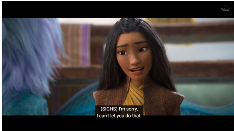
Figure 2. Boun wanted to help Raya bring everyone back

Boun : “Youre gonna bring everyone back? I wanna help.”