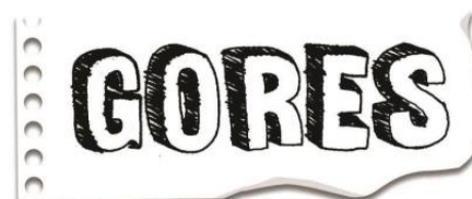
Figure 1. GORES logo.

The meaning of the GORES logo is a typograph that has letters written in the style of a human handwriting as if it were written using a pen that symbolizes the creative power poured by someone and is a symbol of freedom in expressing the shape and style of creativity possessed. GORES writings use capital letters that symbolize a strict principle as a form of strong identity inherent in this application to support efforts to increase student interest and creativity in all forms of art. In addition to typographs in the GORES logo that have meaning, the binder paper background that is the background of the word GORES also has its own meaning. The meaning contained in binder paper is a picture of a white canvas which can then be GORES (etched) a variety of shapes so that it can express emotions and create works. Symbols of binder paper are generally familiar papers found among students so that they