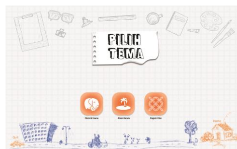
Figure 3. Page 2 Display of the GORES application.

The GORES application is displayed epic with a white background, equipped with gray drawing / painting equipment sketch drawings on the upper side, while on the lower side there are sketch drawings of city views (houses, trees, roads, buildings, vehicles, lights road) painted in blue ink. This blue ink is also used as the basic color of a painting tool (pencil) when drawing / painting in the drawing area. The combination of background composition, application logos, function keys and supporting display (sketch drawings) top and bottom shows that the application concept is simple, minimalist and up-to-date. In the display on the GORES application there are four link buttons which include the Start GORES button, search for images, galleries and quit (exit the application).