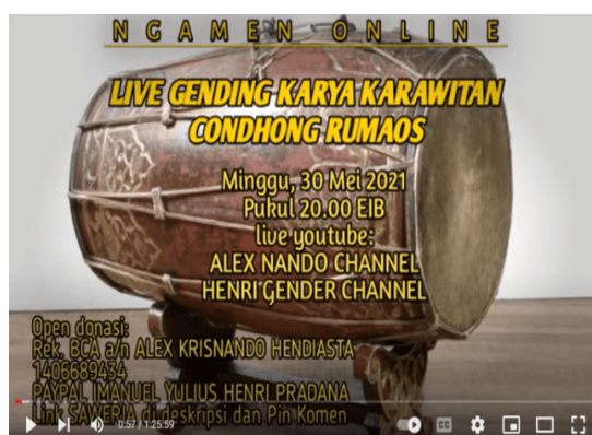
Figure 2. An Example of the " Ngamen Online " Upload on YouTube ( https://www.youtube.com/watch?v=tY1CvhZzcxE&t=1415s )

The term of the " ngamen " is referring to the definition of a person or group who sings several repertoires of songs with simple musical instruments in a certain place or walks around from one place to another, with the aim of getting money or funds. The term is then combined or connected with the term "online" which means referring to activities in the virtual world, with online social media as the means. This is what traditional performing arts artists, especially musicians of the Karawitan done. Their artworks are uploaded through social media. The term " ngamen online " is often used when uploading performing arts on these social media and during live streaming.