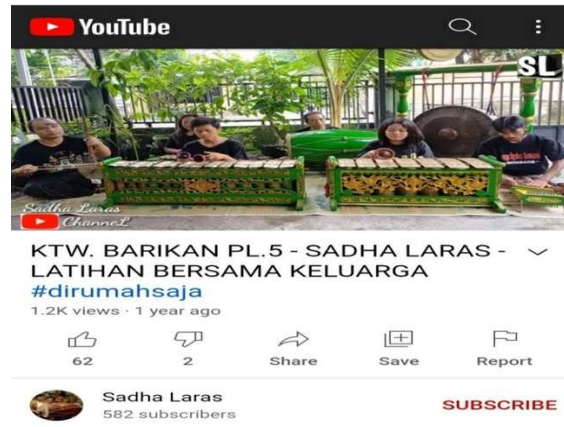
Figure 3. The Example of the Reruns of old repertoires which contains elements of spirituality ( https://www.youtube.com/watch?v=D2f77I1gczs )

As in the example of the figure, a repertoire of the gending that entitled " Ketawang Barikan " is often uploaded as a form of representation to persuasively invite the audience to participate in self-reflection on spirituality. The repertoire that mentioned is containing of prayers and hopes for safety in the midst of the pandemic.