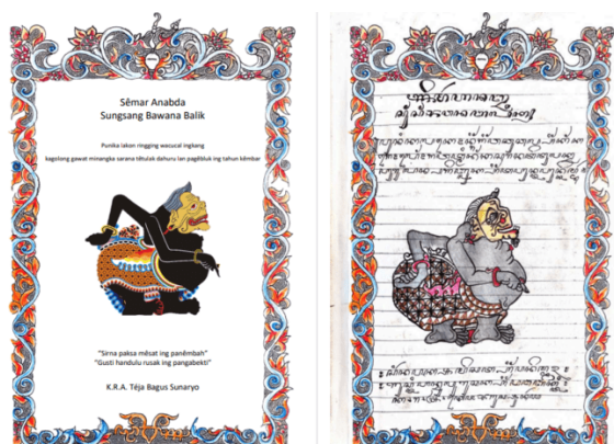
Figure 4. The Textbook Cover of the Wayang Kulit Ruwatan with the title " Semar Anabda Sungsang Bawana Balik " (Private Manuscript)

Textually, this Ruwatan text is held in the form of a performance simple shadow puppets. This is related to the existence of a health protocol that must be obeyed, in order to suppress the spread of covid-19. We do not invite many people, and do not use gamelan instruments in large numbers, but still with ubarampe or complete offerings of ruwatan . The performance of this work is carried out in a minimalist manner, but does not eliminate values contained in a ruwatan play performance (taken from a personal work manuscript text).