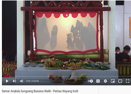
Figure 5. The situation of the virtual performance of the Rumatan Wayang Kulit Ritual with the title: “ Semar Anabda Sungsang Bawana Balik ” in Tirta Kelapa Art Space Gallery ( https://www.youtube.com/watch?v=dG7Z9WzO5vc&t=9251s )

Although virtually, the staging event was finally held on a day that is considered sacred too, Kliwon Friday, August 27, 2021. Moreover, the reason for the procurement of the ritual wayang kulit rumatan that mentioned is because it coincides with the entry of a new time in the Javanese new year, the month of Suro (which is the first month based on the Javanese calendar system) and the calculation of the new windu time as well (i.e. the cycle of time in the Javanese calendar system, 1 windu is equal to 8 years), namely windu Sancaya (known for 4 windu time cycles, namely windu Adi , windu Kuntara , windu Sengara , and Windu Kuntara ). For the Javanese people, it is believed that the times in the month of Suro are special times for all activities with a spiritual nuance. Even among the Javanese people think that all prayers and hopes accompanied by mystical and spiritual behaviors can be granted in this month. It was also inspired by the performers of traditional performing arts or artists and cultural observers who mainly live in Yogyakarta and Surakarta-Central Java.