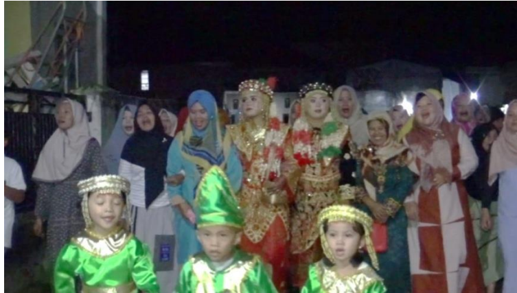
Figure 1. Process as a Balahak performance