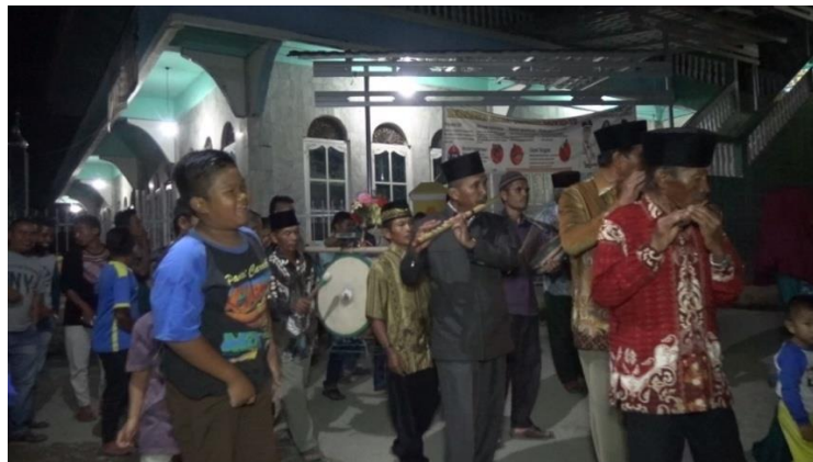
Figure 2. a music in Balahak performance

It can be concluded through the Balahak circuit process also according to what is stated Kinesti (2015) Performance is a system of relationships between parts in one whole. Soedarsono (2010:5) also stated the Show is a blend of various important aspects such as plays, performers, fashion, accompaniment, performance venues and audiences. In the